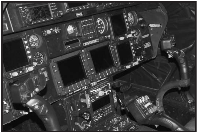
DIGITAL COCKPIT – The A109E Power's digital cockpit includes the latest in helicopter avionics, including moving maps, weather radar and an advanced autopilot system.

LifeFlight lead helicopter mechanic Wendell Stadig, a member of LifeFlight's maintenance crew since the service was founded, says the avionics package installed in the new aircraft is "state-of-the-art" and will better serve LOM's "mission profile." The older aircraft, while IFR certified were not IFR capable due to range and performance limitations. Since its