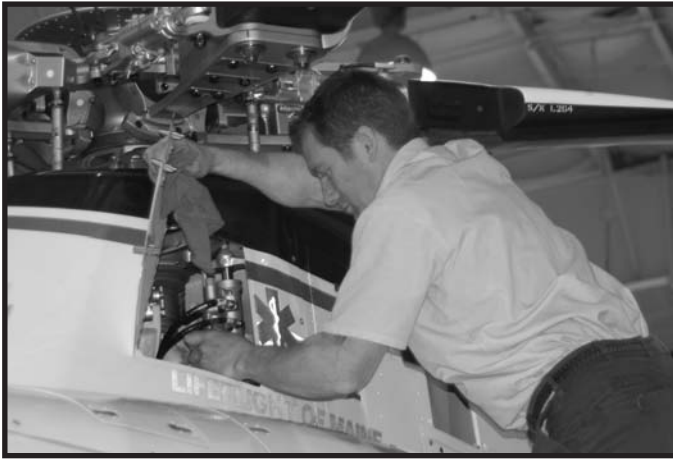
FINAL TOUCHES – An Agusta Aerospace Corporation technician makes a final adjustment on one of LifeFlight’s new helicopters.

maintained, become more and more expensive to operate. Because of design changes, LifeFlight’s new helicopters don’t require certain routine maintenance that was necessary with the aircraft they replaced.