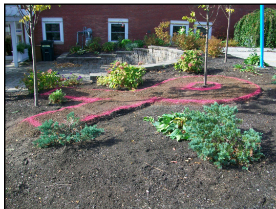
Pink Tulip Project at the Arbor House... Thank You Angels and staff of Oxford Networks!